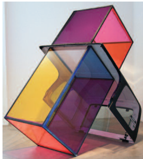
Top: Pat Steir, The Nearly Endless Line , 2010-11, site-specific installation Above: Fiona Rae, The Woman who can Do Self-Expression Will Shine Through All Eternity , 2010, oil, acrylic and gouache on canvas, 84 x 69" Above right: Sarah Braman, Teenage Spaceship , 2010, 108 x 96 x 57" , Jeep cap, steel plexiglas and paint