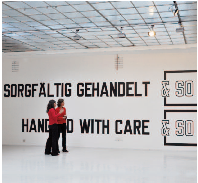
Lawrence Weiner, SORGFÄLTIG GEHANDELT & SO WEITER / HANDELED WITH CARE & SO WEITER, all matte black vinyl; exhibition Personal Structures: Time Space Existence at Georg Kargl Gallery Vienna